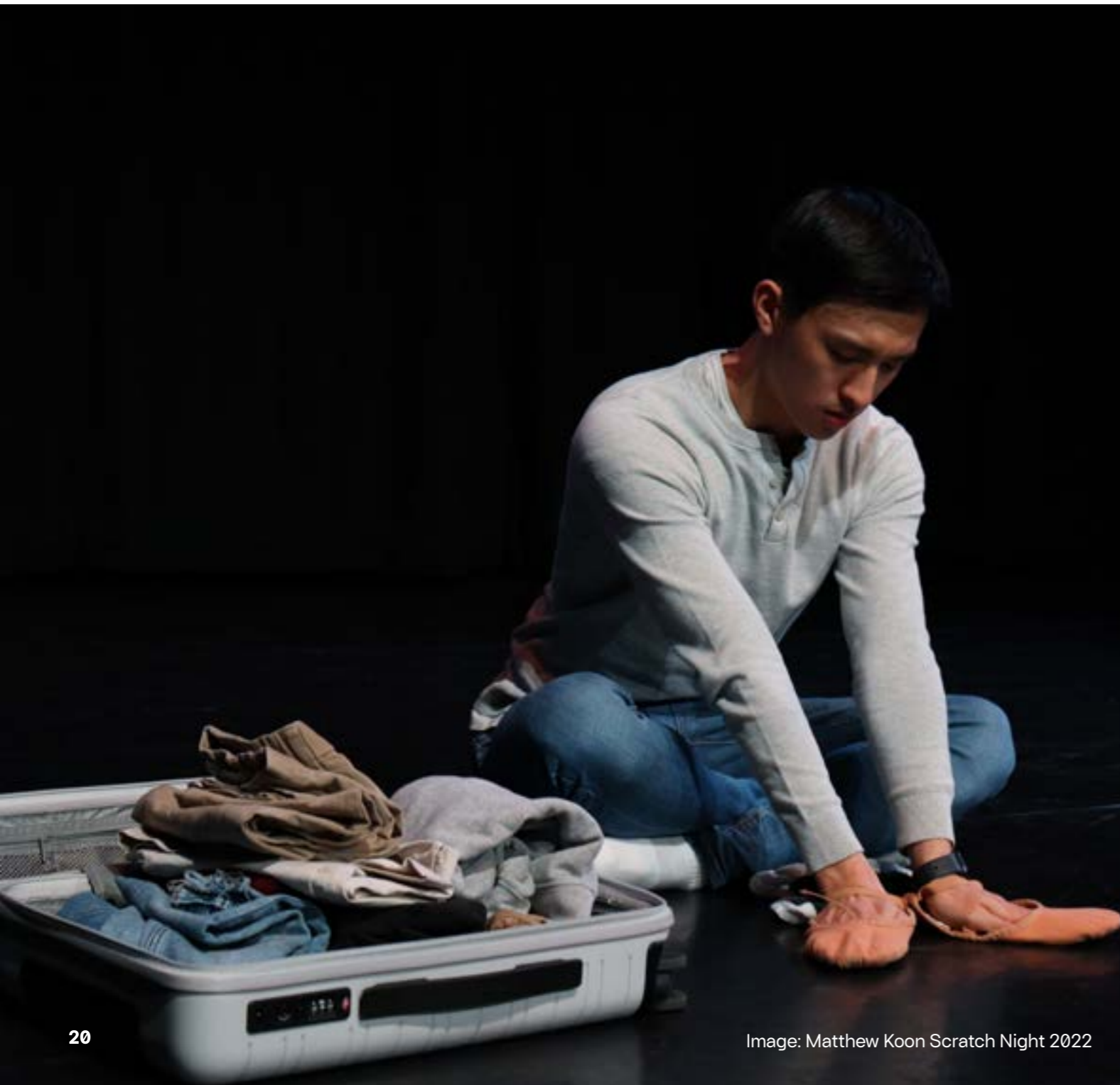
Scratch Night 2022