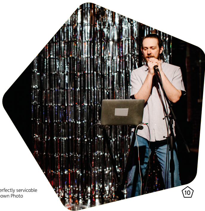
Image: Empty Orchestra by Lewys Holt/ perfectly servicable in association with Discerning Nights

Have your very own karaoke moment accompanied by professional dancers. Discover shared songs, create an evolving playlist, and take part in an unforgettable, fun-filled experience!